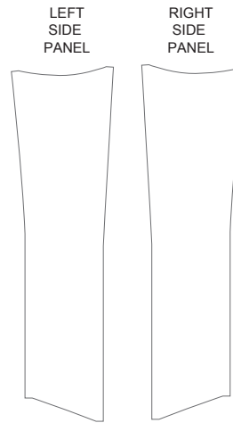
LEFT SIDE PANEL